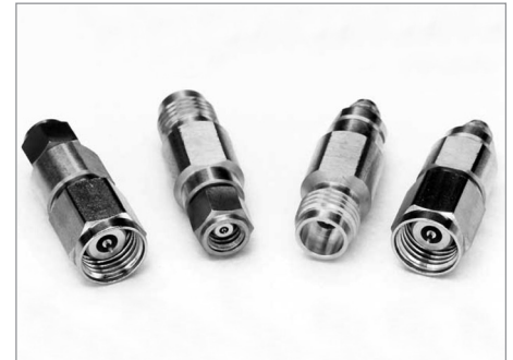
Keysight 11922A/B/C/D Adapters