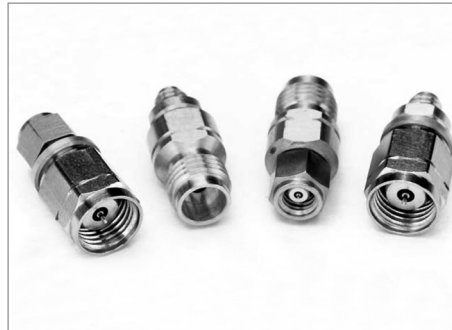
Keysight 11921E/F/G/H Adapters