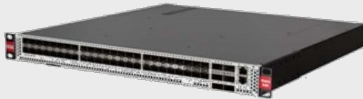
Figure 1. E40 front