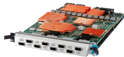
Novus native QSFP28 8-ports, 100/50/40/25/10GE 1-slot load module