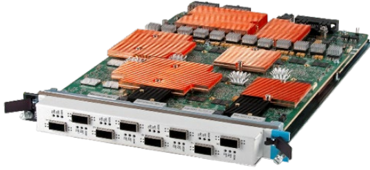
Figure 1. Novus native QSFP28 8-ports, 100/50/40/25/10GE 1-slot load module

Novus QSFP28 100G load module family enables high-density, multi-rate switch/router testing. With Novus, Novus-M, and Novus-R providing full, mid-range, and reduced scale and performance, respectively, it is the ideal platform for interoperability and functional testing, as well as high-port-count performance testing across cloud, hyperscale data center, service provider, and enterprise networks. It supports 8-ports of native QSFP28 100GE with optional fanouts that support 16-ports of 50GE, 8-ports of 40GE, or 32-ports of 25GE or 10GE per load module. We also offer an affordable lower-density 4-port full feature configuration that can upgrade to 8-ports as testing grows to take advantage of full power, performance, and scale of this load module.