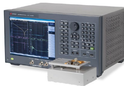
16091A terminal adapter and 16092A 7-mm test fixture

For more information about how to select impedance test accessories, refer to E5061B impedance analysis data sheet: http://literature.cdn.keysight.com/litweb/pdf/5990-7033EN.pdf