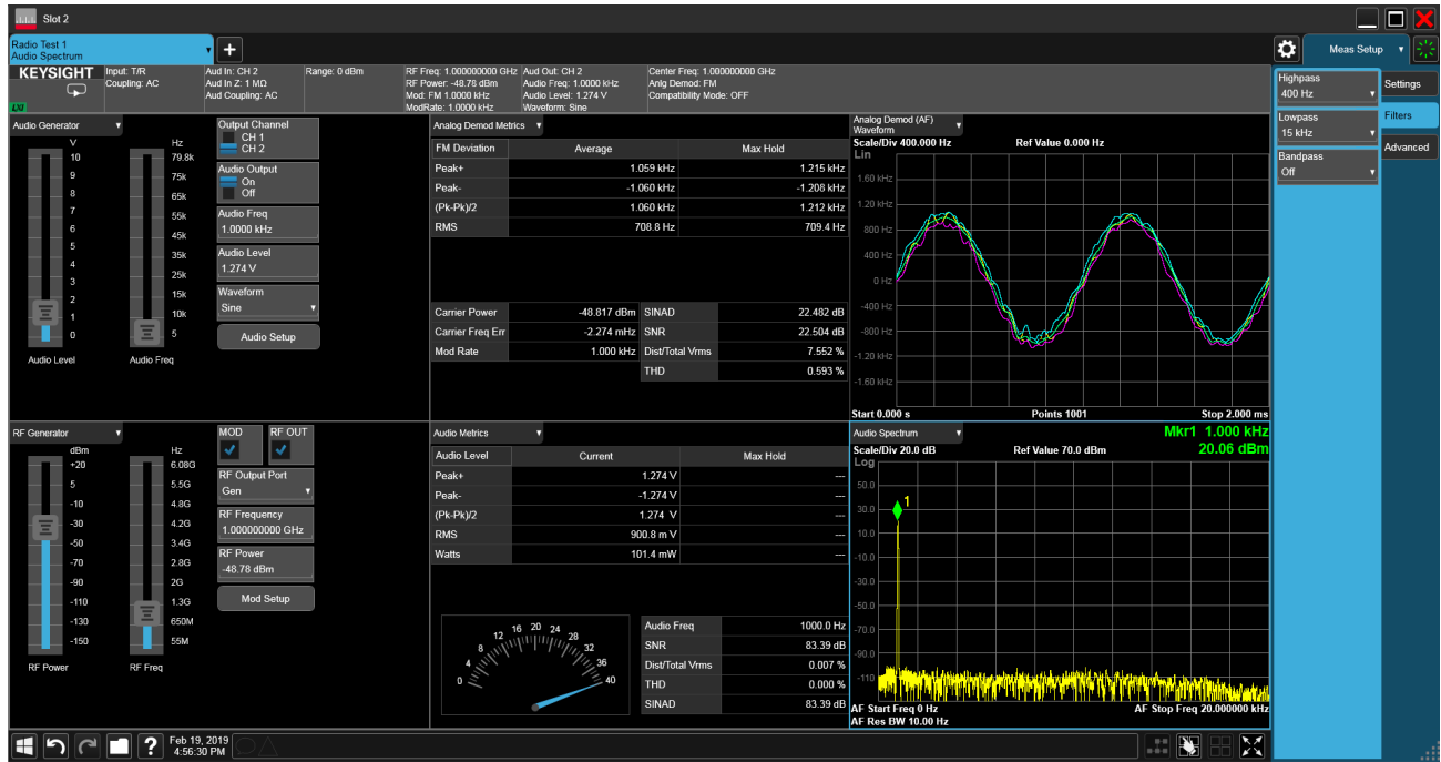
Figure 1. N9093EM0E basic analog test

While having full control of the RF and audio generators, the Audio Analysis Metrics gives you all the necessary audio measurements from the radio. These include audio frequency, signal-to-noise ratio (SNR), distortion, total harmonic distortion, SINAD, audio level (PK+, PK-, (PK-PK)/2, RMS, and watts), AM depth, FM deviation, and an analog SINAD meter.