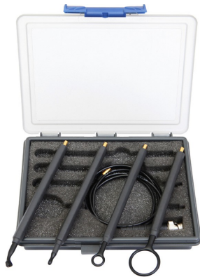
N9311X-100 (Near field probes)