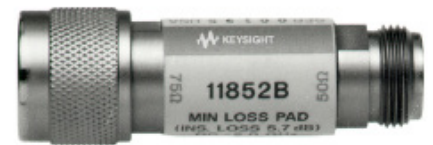
Keysight 75-ohm test accessories