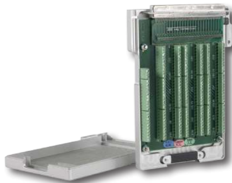
Figure 2. PXI connector block