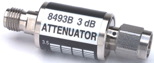
Figure 1. 8493B Coaxial Fixed Attenuator