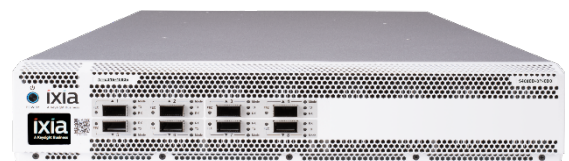
AresONE-S QSFP-DD-400GE 8-port, fixed chassis system