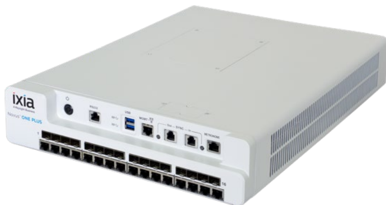
Novus ONE PLUS

Novus ONE PLUS supports up to line-rate L2/3 traffic generation and analysis, high-performance routing/bridging protocol emulation, and true L4-7 application traffic generation and subscriber emulation—all with one fixed chassis!