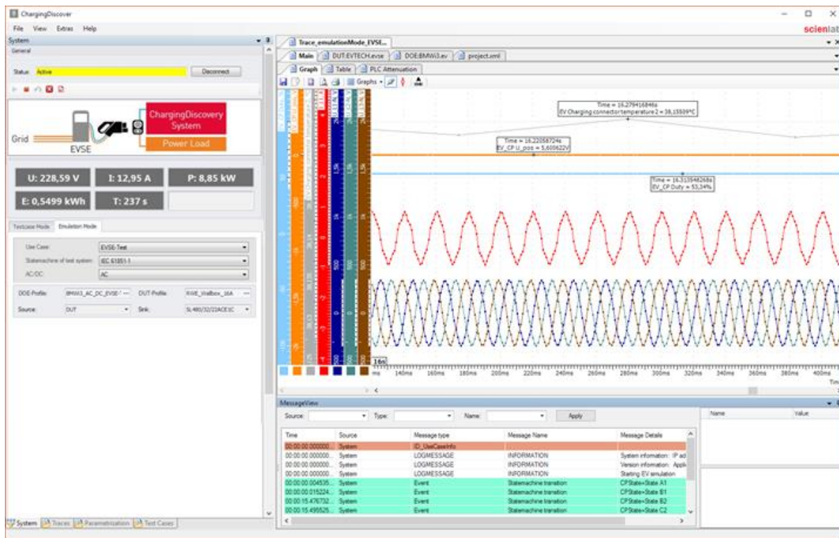
Figure 1: Main Window | System View, Graph & Message View

Note: In order to execute custom test cases on the CDS hardware, the “Test Editor System Key” option is mandatory.