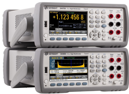
Figure 5. Keysight's Truevolt Series DMMs

For more information about Keysight's Truevolt Series DMMs, visit www.keysight.com/find/Truevolt and Keysight's 8.5-digit high performance DMM, visit www.keysight.com/find/3458A