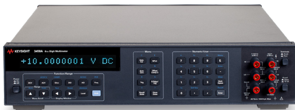
Figure 6. Keysight's high performance 3458A DMM

Keysight enables innovators to push the boundaries of engineering by quickly solving design, emulation, and test challenges to create the best product experiences. Start your innovation journey at www.keysight.com .