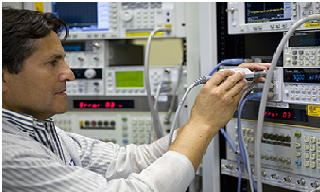
Figure 4. Test rack with equipment

You have positioned your DMM in a rack and have controlled the air flow and temperature monitoring (Figure 4). Even with these precautions, the internal temperature of your system is 15 °C higher than ambient because of the other instruments in your system. With a 15-degree rise, your DMM reading specifications are now higher than design tolerances with the TC specification adders. ACAL can reduce your TC errors and help you meet the specification budget for your DMM measurements.