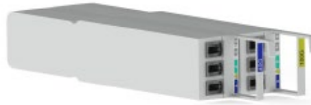
Flex Tap MTP