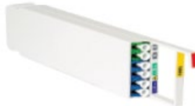
Flex Tap SECURE+