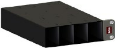
Mini Chassis – RK-Flex-8