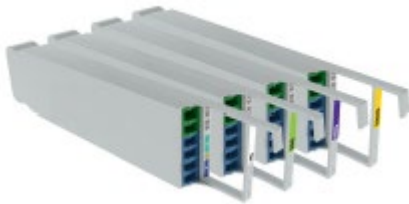
Flex Tap LC