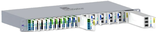
Ixia Flex Taps in RK-FLEX-24 Rack