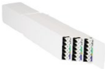
Flex Tap VHD