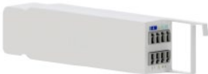
Flex Tap BiDi