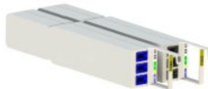
Flex Tap UHD