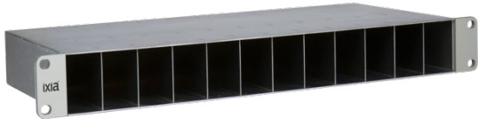
Assembly Rack Chassis – RK-Flex-24