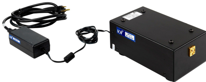
Figure 3. The power supply is connected to the frequency extension module.

Each E8257DVxx frequency extension module comes standard with an external 9 V DC power supply.