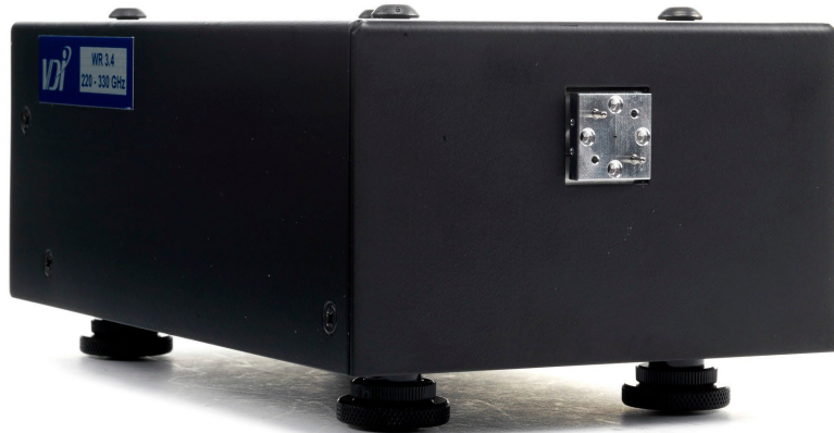
Figure 1. This E8257DV03 frequency extender covers the WR3.4 band from 220 to 330 GHz.

The E8257DVxx signal generator frequency extension modules expand the operating range of microwave signal generators up into the millimeter frequency range. They combine high output power and low phase noise with broad frequency coverage over full waveguide bands. Standard features include TTL-controlled on/off modulation up to approximately 1 kHz and voltage-controlled RF attenuation (UCA). The RF signal from the signal generator gets multiplied in the module to a much higher frequency and the resulting millimeter signal exits through the rectangular waveguide output. A single coaxial cable provides the connection between the signal generator and the E8257DVxx module.