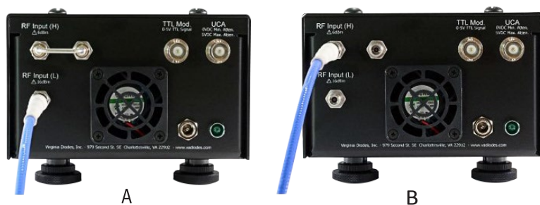
Figure 2. The standard frequency [A] and high frequency [B] RF input modes are shown above. The coaxial jumper connection must be used when using standard frequency operation. With the jumper removed, only the high frequency RF input port is operational.

The E8257DVxx modules provide two different RF inputs, depending on the frequency range of the signal generator. The standard RF input is designed for 20 GHz signal generators (see Figure 2), while the high-frequency RF input is optimized for a 40 or 50 GHz signal generator, depending on the waveguide band. The high frequency input bypasses the first multiplication block (i.e. a doubler or tripler) resulting in a cleaner output spectrum.