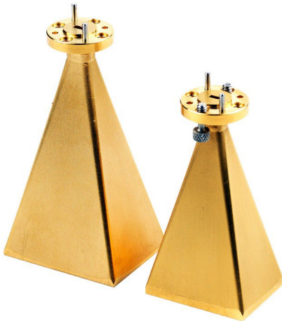
Figure 6. Waveguide horn antenna.