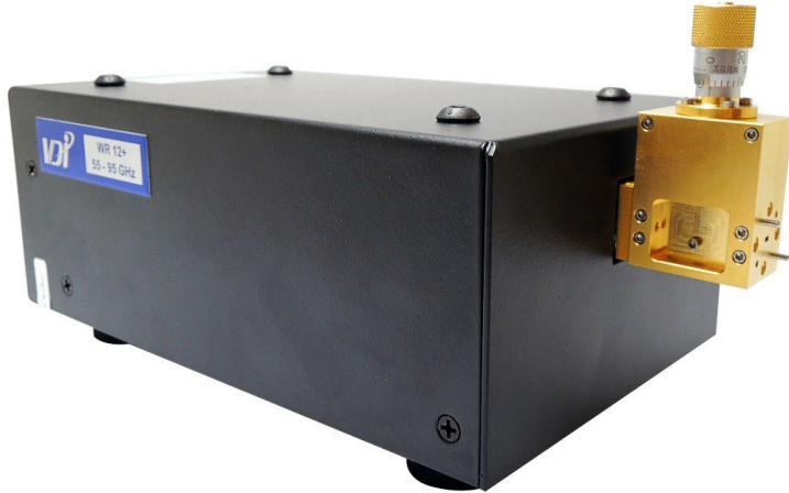
Figure 5. VDI signal generator frequency extender with Option A30 variable mechanical attenuator.

Option A30 Variable mechanical attenuators (0 to 30 dB) are available on most millimeter wave frequency extenders and noted in Table 1.