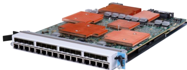
NOVUS10/5/2.5/1/100M16DP 16-port Dual-PHY 5-speed load module

Support for Dual-PHY SFP+ and 10GBASE-T RJ45 copper that provides line-rate L2/3 traffic generation and analysis, high-performance routing/bridging, and host and access protocol emulation. True L4-7 application traffic generation and subscriber emulation is available, with the full feature load modules. With up to 16 Dual-PHY ports per module, you can create ultra-high-density test environments for 10/5/2.5/1/100M Ethernet over copper and for 10/1/100M over fiber. Up to 192 5-speed test ports are supported in a single 12-slot rackmount chassis.