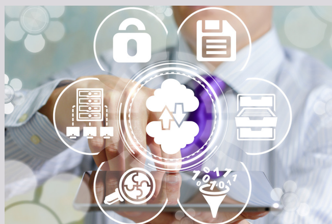
Cloud migration's unique advantages and even more unique challenges