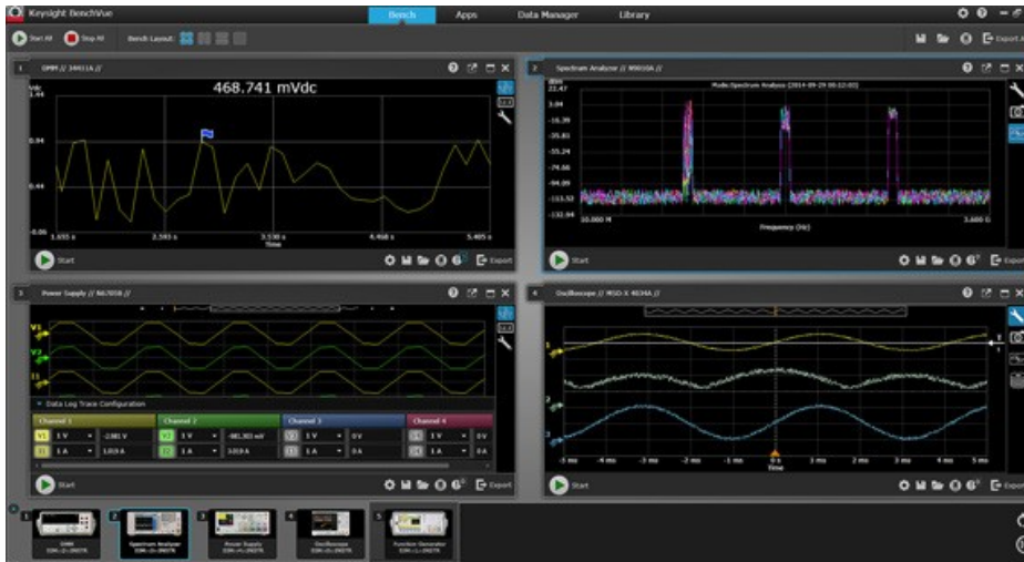
Figure 1. See your measurements across instruments in one place to quickly correlate measurement activities and obtain actionable insights.