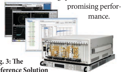
Fig. 3: The Reference Solution for RF PA/FEM characterization and test combines AXIe and PXI instruments for characterization of power amplifiers and front-end modules.

module characterization for PAD and other devices, and includes measurements for S parameters, demodulation, power, adjacent-channel power, and harmonic distortion. Test-code examples show how to optimize test throughput without compromising performance.