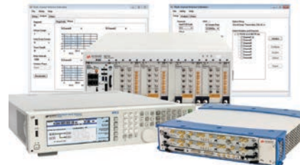
Fig. 4: The Multi-Channel Antenna Test Reference Solution is a mix of traditional, PXI, and AXIe modules with a scalable number of channels.

Another instance is the Multi-Channel Antenna Test Reference Solution (Fig. 4). This platform, which combines hardware and software to address narrowband antenna calibration test, has a flexible configuration with a scalable number of channels, options for down-conversion of antenna-receive channels, selectable analysis bandwidth, and a selection of RF/microwave sources. The main components in the solution include a vector-signal analyzer, vector-signal generator, vector-network analyzer, digital stimulus/response, a measurement accelerator, and Signal Studio software.