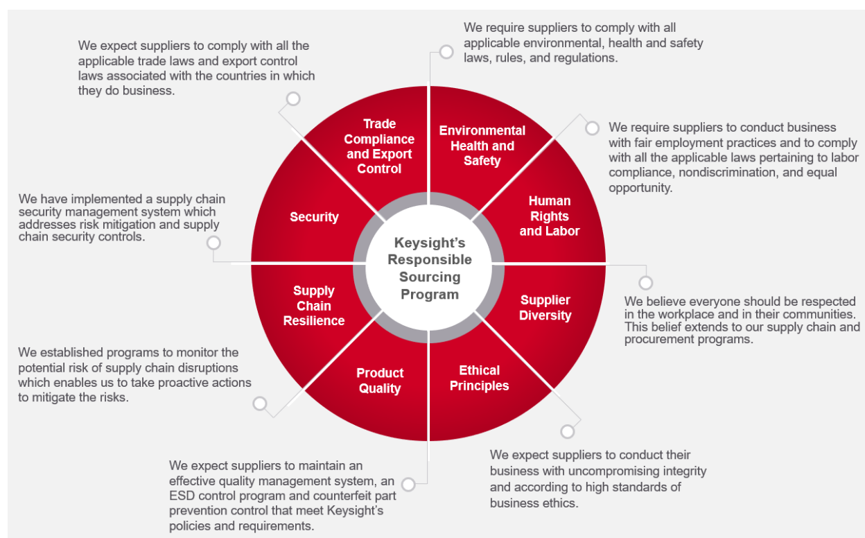
Figure 2. Principles of Keysight's Responsible Sourcing program

Our Responsible Sourcing program is managed across a key set of principles including: