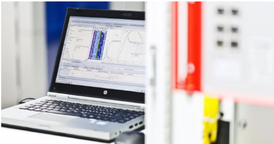
Figure 2. Scienlab Energy Storage Discover controls individual test systems.

Scienlab Energy Storage Discover (ESD) is the intuitive test-software environment for developing, performing, and analyzing tests for an individual test system.