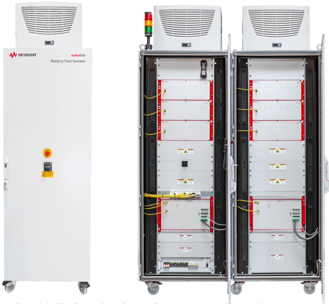
Figure 1. SL1007A Cell Test System, from left to right: Single rack-cabinet configuration, front door closed and double rack-cabinet configuration, front doors opened. Example configuration for large channel count or very high-current system.