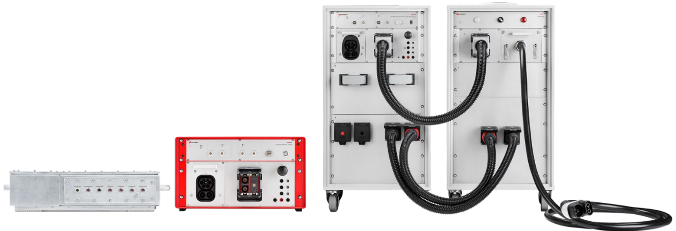
Figure 2. From left to right: SL1040A CDS – EMC Series, SL1040A CDS – Portable Series and SL1047A CDS – High-Power Series.

Find out more about the SL1047A Scienlab CDS HP Series .