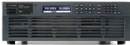
Figure 1. RP7900 Series Regenerative Power System.