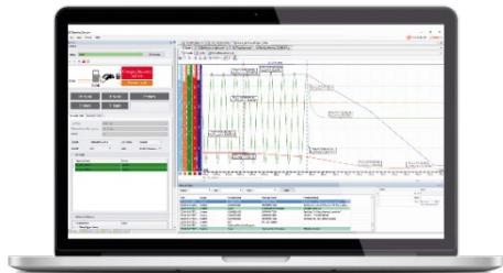
Figure 3. SL1093A Scienlab Charging Discover test software controls the CDS.

Find out more about the SL1093A Scienlab Charging Discover Test Software .