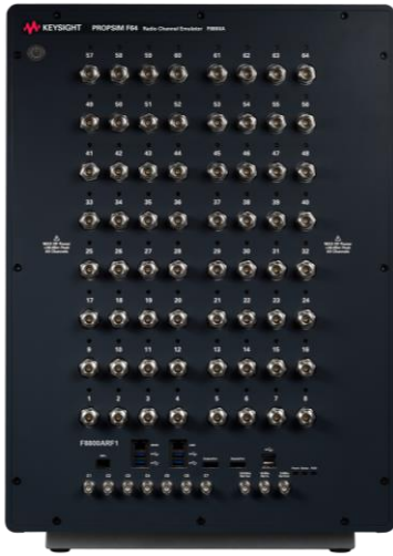
F8800ARF1 RF channel units