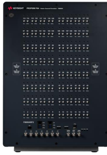
F8800ARF2 RF channel units