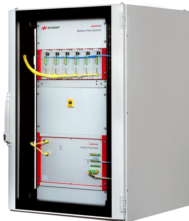
Formation system with 6 channels

For safety reasons, two basic measurements need to be continuously monitored during the formation process: cell voltage and temperature. Keysight's Scienlab solutions thus have two active safety mechanisms. Firstly, the sensing wires for voltage measurement are fitted with wire-break detection which prevents the cells being overcharged unintentionally. Secondly, each formation channel has a temperature sensor which monitors the temperature of the cells. If the measurements exceed certain thresholds the relevant channel is automatically switched off and the user is informed by an error message.