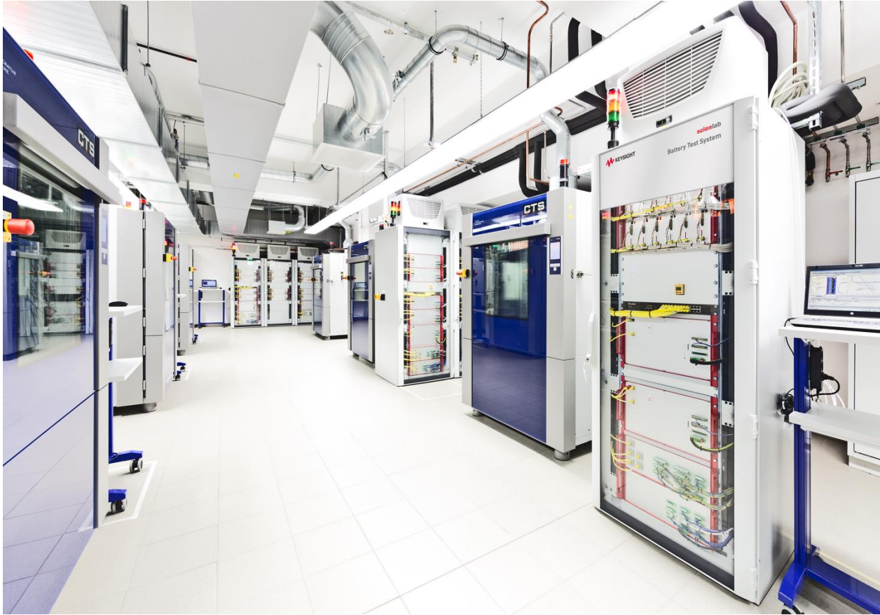
Test bench for characterization and development of battery cells and modules