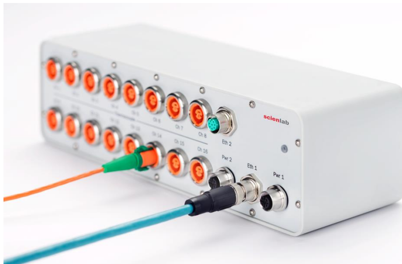
Measurement & Control Module

In addition to laboratory use, test systems are required for end-of-line testing in energy storage device production. Here, the focus is not so much on finding a flexible solution, but rather on developing a reduced, tailor-made solution with minimal investment costs. In this field, Keysight offers a reliable EOL system that meets production line test requirements.