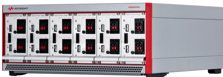
Desktop system for testing up to 12 cell samples

A large number of channels are necessary particularly when a large number of cells are being tested (e.g. button cells), and these demand extensive wiring. Our system enables a convenient and ergonomic adaption of cell samples, without the annoying tangled cables. Depending on the customer application the load and measurement outputs for each channel are easily accessible on the front plate and can be switched to a system connector on the back of the test system. In addition, the compact system design saves on space requirements: a 96-channel system requires just 0.8 x 0.8 m 2 for example.