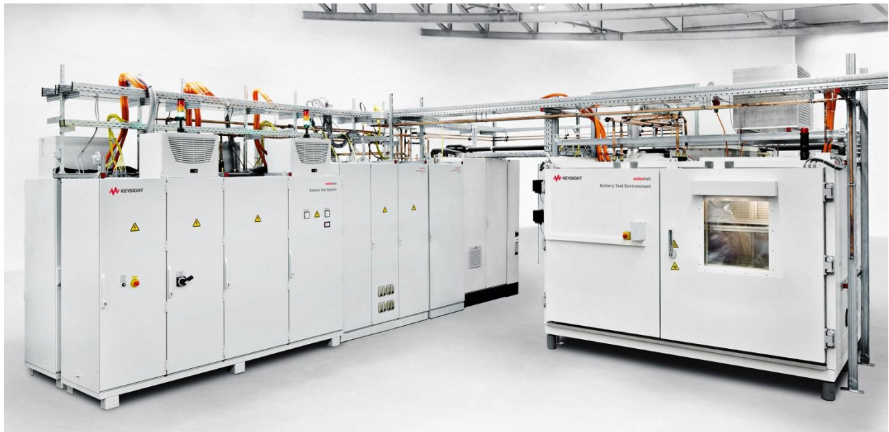
Test bench for validation of battery packs

In order to test complex battery packs, it is of paramount importance that all system-relevant variables are controlled and recorded synchronously. These not only include the battery voltage, current and temperature, but particularly all the signals related to the BMS. It is necessary to react to specific CAN messages within 1 ms, as well as to regulate recorded operational cycles in the test environment in real time. Our Scienlab test systems for battery packs offer a complete real time solution for this. In addition to highly dynamic and precise electronic power output signals, all analog and digital inputs and outputs are provided conveniently for the user through the Scienlab Measurement & Control Modules.