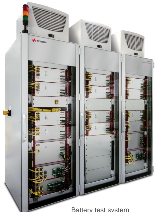
Battery test system

When testing battery packs, e.g. for power tools, the original charger must be integrated into the testing process. This allows the charging process to be observed and the interaction between the battery pack and the charger to be investigated if necessary. For this application, the Scienlab module test systems from Keysight have optional inputs for connection of the charger. Switching between the external charger and the internal power electronics can be carried out conveniently during the test phase. The electrical variables are measured using exactly the same measuring technology. The results are also recorded in the results file.