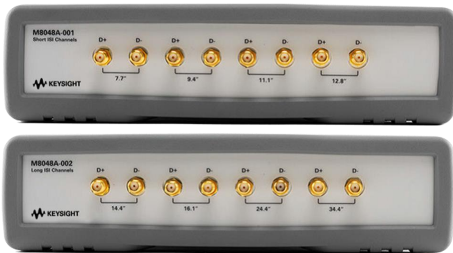
Figure 3: Front panel view of M8048A option 001 (top) and M8041A option 002 (bottom).