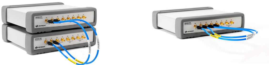
Figure 7: Short matched SMA cable pair for cascading ISI channels from two units or within one unit.