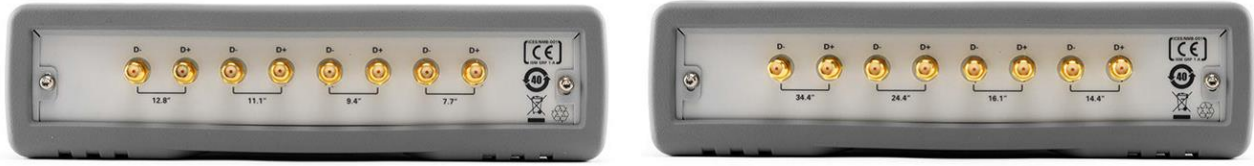
Figure 6: Rear panel view of M8048A-001 (left) and M8028A-002 (right).