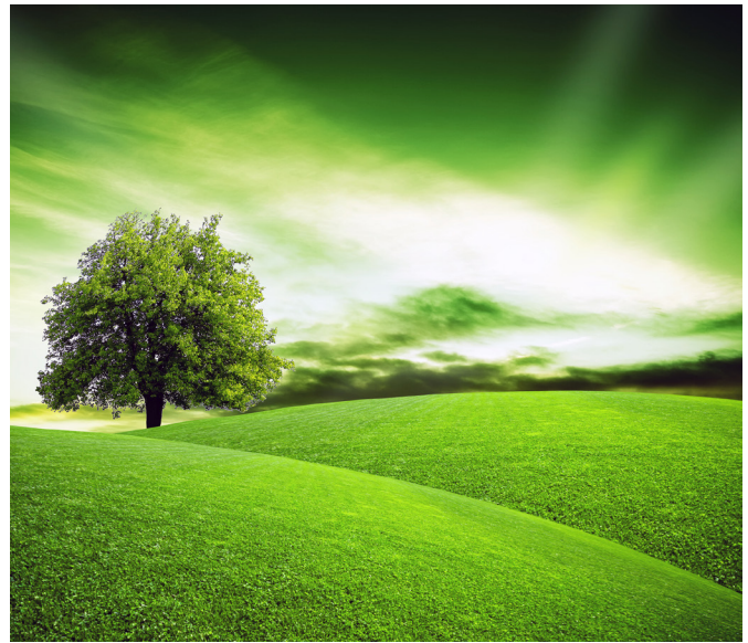
Energy saved due to conservation and efficiency improvements