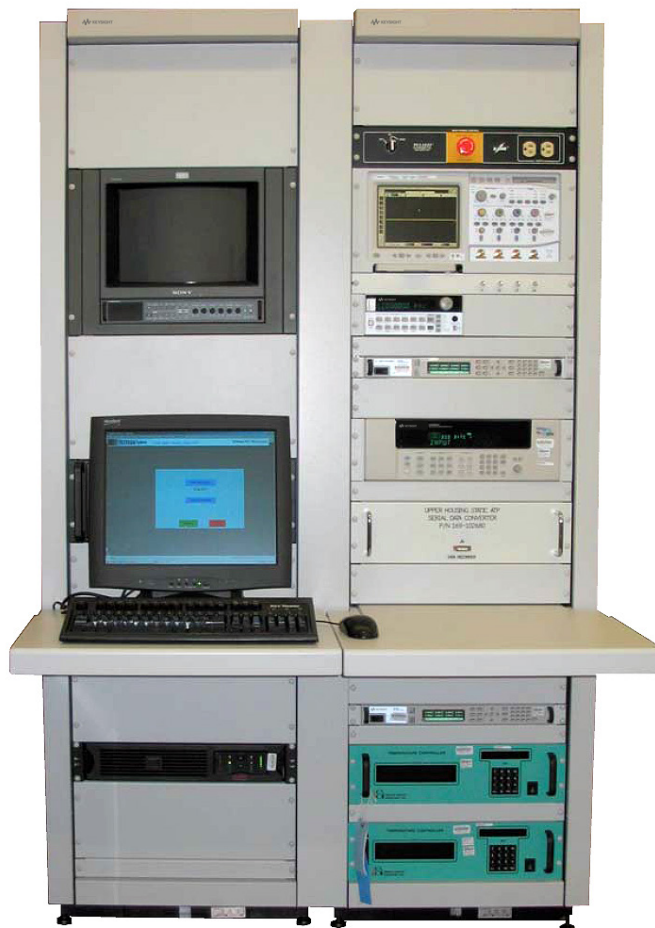
Figure 1: The Sensor Fused Weapon ATE System employs two N6700 Modular Power Systems. For more information, see case study #3 on page 6.

Although most DC power supplies can measure current, measuring current during a transient event, such as this transmit pulse, can be challenging. Many power supplies use an integrating measurement and the period of integration is much longer than 12 milliseconds in order to integrate out noise. As a result, the one single measurement that is obtained via this integration method will contain signal information that is before, during, and after the 12 millisecond wide pulse, so the reading will not properly represent the current during the pulse. And even if the user could select the integration window so that the measurement would be less than 12 milliseconds wide, there would still be the challenge of synchronizing or triggering the measurement to ensure that the measurement was taken during the pulse. So integrating measurements could not be used, and so the only solution would be to digitize the pulse.