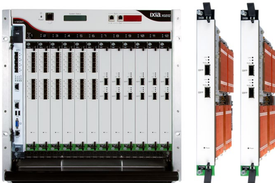
XGS12-HS Chassis and PerfectStorm 40GE Load Modules

A single, integrated system equipped with 12 PerfectStorm blades, allows control of application traffic to nearly a terabit, up to 720 million concurrent connections, and new TCP connections rates of up to 24 Million. The hardware-based acceleration supports massive encryption levels with up to 240Gbps of SSL traffic and 480Gbps of IPsec traffic per system. The system uses inline field programmable gate arrays (FPGAs) for enhanced accuracy pertaining to latency measurements with a resolution of 10ns.