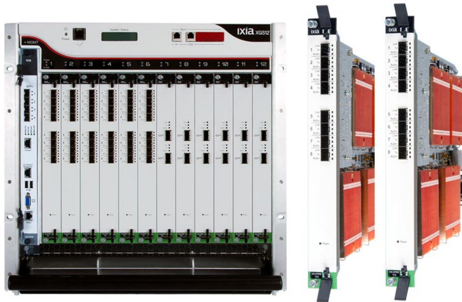
XGS12-HS chassis and PerfectStorm 10/1GE Load Modules

A single, integrated system equipped with 12 PerfectStorm blades allows control of application traffic to nearly a terabit, up to 720 million concurrent connections, and new TCP connection rates of up to 24 Million. The hardware-based acceleration supports massive encryption levels with up to 240Gbps of SSL traffic and 480Gbps of IPsec traffic per system. The system uses inline field programmable gate arrays (FPGAs) for enhanced accuracy pertaining to latency measurements with a resolution of 10ns.