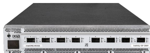
AresONE OSFP 400GE, 8-port, fixed chassis system