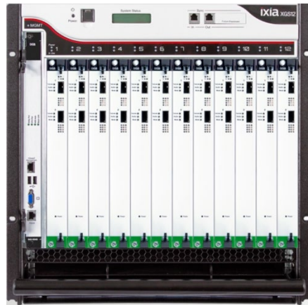
XGS12-HSL Chassis with CloudStorm Load Modules

CloudStorm breaks the SSL and IPsec speed test barriers, with its capability to benchmark 960Gbps of encrypted traffic from a single fully populated XGS12 chassis. Powered by encryption hardware offload, CloudStorm enables data center operators to find the right balance between security and end-user quality of experience as traffic is moving toward total encryption, with HTTP/2, 2/4k keys and ECC ciphers are adopted.