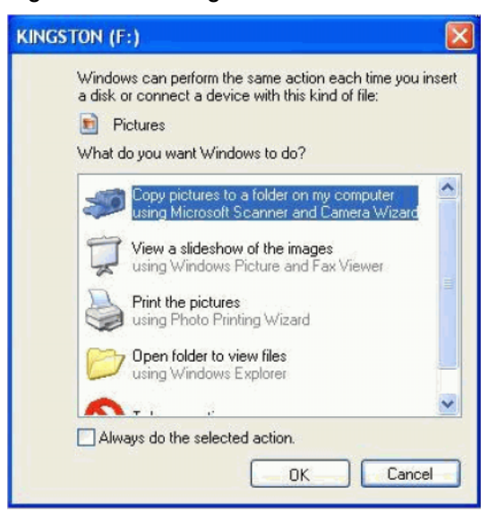
Figure 1 USB Storage Device Configuration Menu

7. The signal analyzer will automatically consume the License File. (This may take a few minutes) When the License File is consumed the Keysight License Manager will display a "Successful License Installation" message as shown in Figure 2.