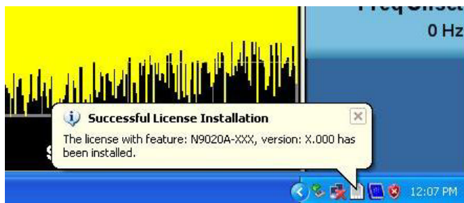
Figure 3 Successful License Installation