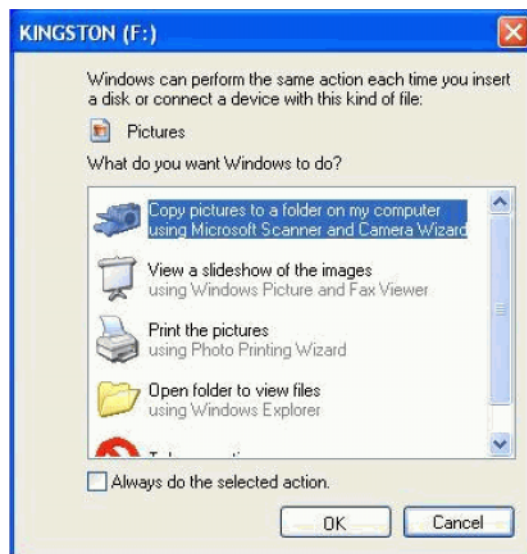
Figure 2 USB Storage Device Configuration Menu