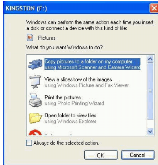
Figure 1 USB Storage Device Configuration Menu