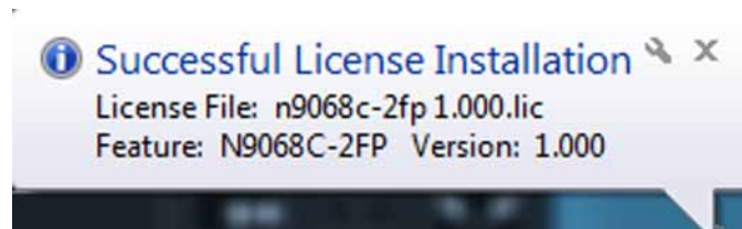
Figure 2 Successful License Installation