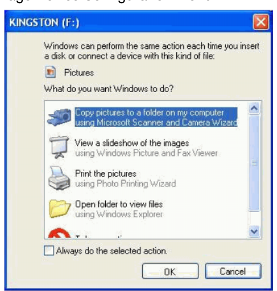
Figure 1 USB Storage Device Configuration Menu