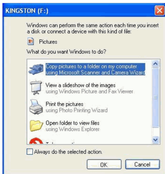
Figure 1 USB Storage Device Configuration Menu