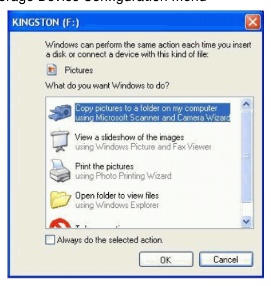
Figure 1 USB Storage Device Configuration Menu