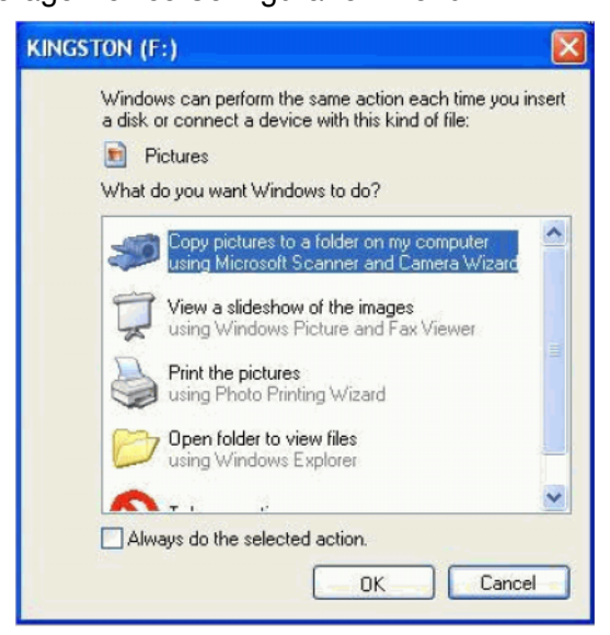
Figure 1 USB Storage Device Configuration Menu

7. The signal analyzer will automatically consume the License File. (This may take a few minutes) When the License File is consumed the Keysight License Manager will display a "Successful License Installation" message as shown in Figure 2.