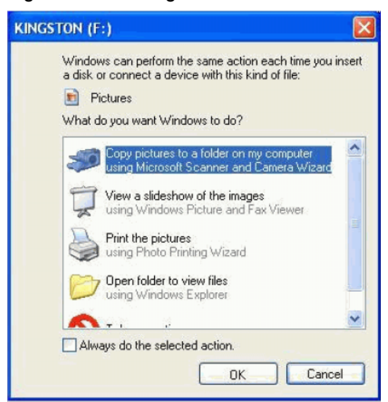
Figure 1 USB Storage Device Configuration Menu

7. The signal analyzer will automatically consume the License File. (This may take a few minutes) When the License File is consumed the Keysight License Manager will display a "Successful License Installation" message as shown in Figure 2.