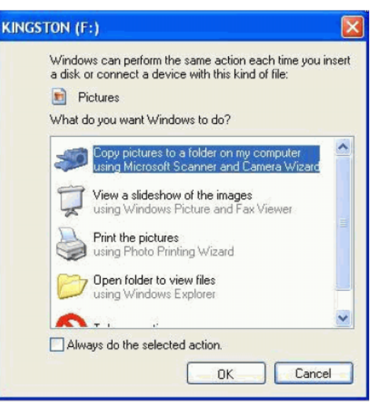
Figure 1 USB Storage Device Configuration Menu

7. The signal analyzer will automatically consume the License File. (This may take a few minutes) When the License File is consumed the Agilent License Manager will display a "Successful License Installation" message as shown in Figure 2.