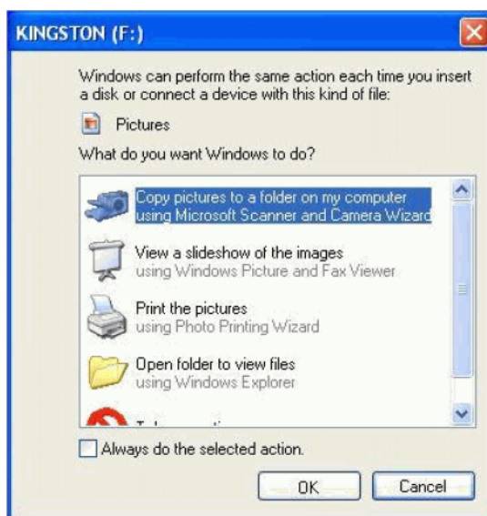
Figure 1 USB Storage Device Configuration Menu