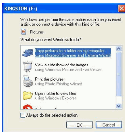
Figure 1 USB Storage Device Configuration Menu