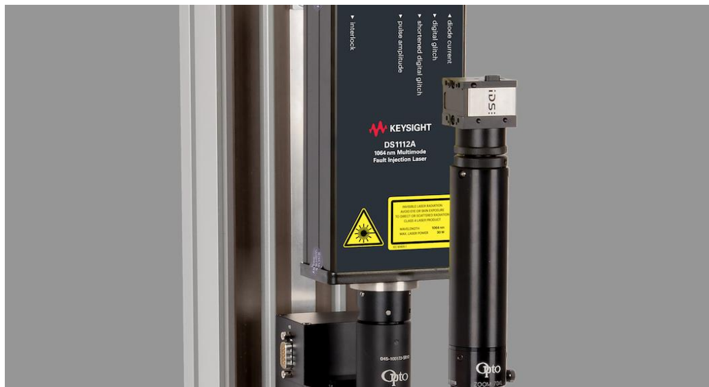
Figure 3. The 1064 nm DS1112A Multimode Fault injection Laser mounts directly on the Fault Injection Laser Station or onto the Spot Size Reducer to reduce spot diameter by a factor of 10x