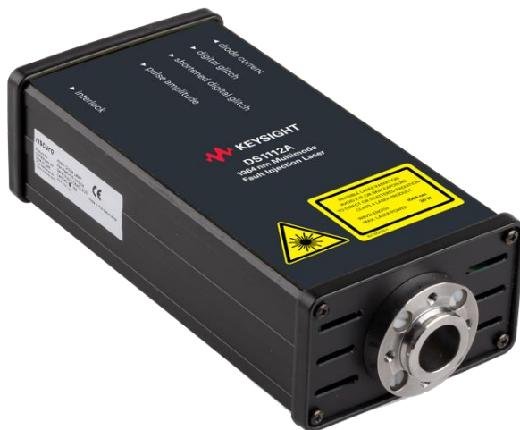
Figure 2. A free laser beam exits from this side (pictured above). Connectors for the interlock switch, power control, triggering, and fault injection laser current monitor are on the other side

Multimode fault injection lasers are compatible with the Fault Injection Laser System, Dual Laser Fault Injection System, and older Diode Laser Station. Optical power and laser timing are controlled by the Smartcard Voltage and Clock Glitcher or Glitch Pattern Generator.