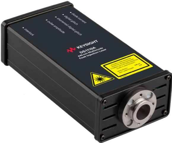
Figure 1. The 445 nm DS1110A Multimode Fault Injection Laser’s blue light can penetrate apertures in metal layers (front side), which are smaller than 1 micron

Thermo-electric cooling inside the lasers provide accurate temperature control for laser power stability and low trigger jitter. A sealed laser container with protective gas minimizes contamination and aging compared to laser cutters.