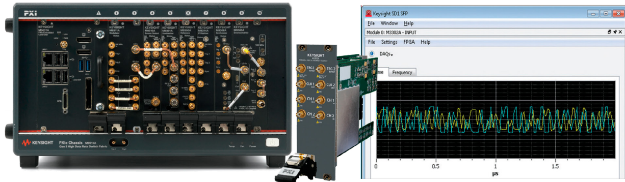
Figure 1. Keysight E6962A Automotive Ethernet Rx Compliance solution

After competitive evaluations, the car maker chose Keysight's E6962A Automotive Ethernet Rx Compliance solution, part of the Keysight suite of automotive Ethernet compliance solutions.