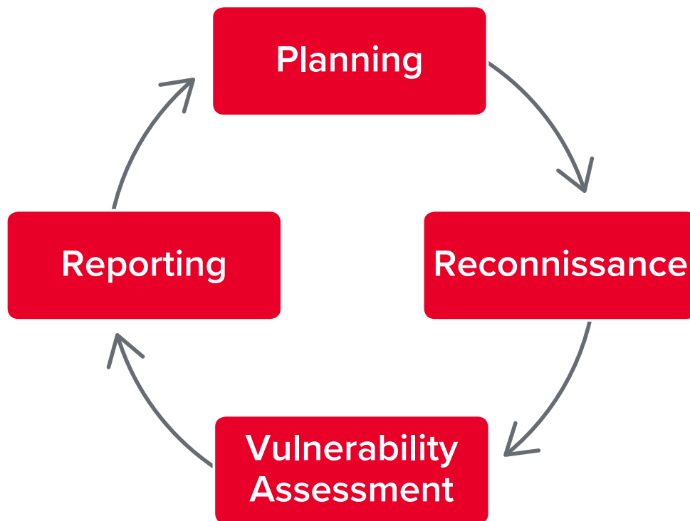
Figure 1. Flywheel chart demonstrating SecurityLabs reporting