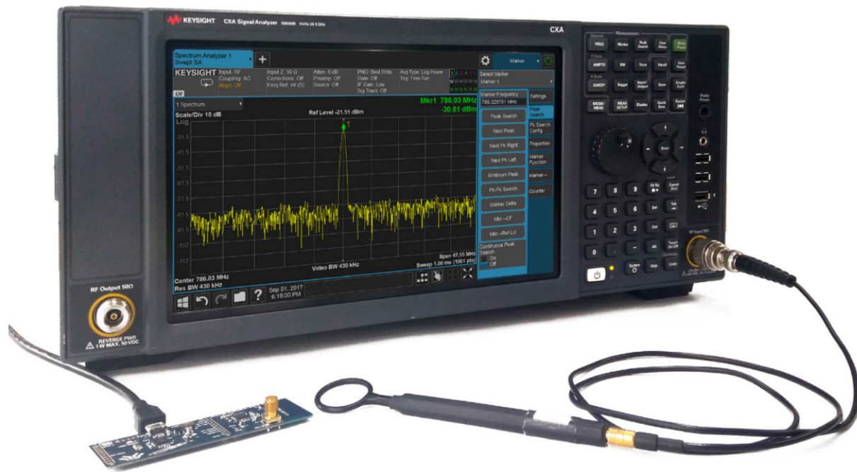
Figure 2. Near-field probe and CXA signal analyzer test the emission of PC LAN port during design cycle before full compliance testing

It can be difficult to tell where EMI failures are coming from since compliance tests themselves won't tell you where exactly the source of the problem is. Radiated emissions may come from a USB port, a LAN port, the seam of a shield, a cable, a buffer, a clock or even a power cord. You need to either troubleshoot yourself or obtain troubleshooting services from a lab or a third party. In this situation, near-field tests are the only way to locate such emission sources and is typically performed using a signal analyzer and a set of near-field probes.