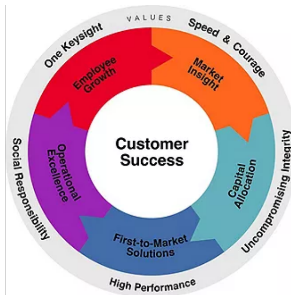
Figure 1. KLM Customer success

Keysight recognizes that climate change is an economic, social, and environmental challenge and is committed to helping minimize the impacts of climate change by conducting business in an ethical, environmentally sustainable, and socially responsible manner. To exemplify this commitment, Keysight set ambitious greenhouse gas (GHG) emissions reduction, energy reduction, and renewable electricity targets to prepare the company for a low-carbon future. The company aims to achieve net zero emissions in company operations (scopes 1 and 2) by the end of fiscal year 2040 and set near-term science-based targets (SBTs) covering scopes 1, 2 and 3 that have been approved by the Science Based Targets initiative (SBTi).