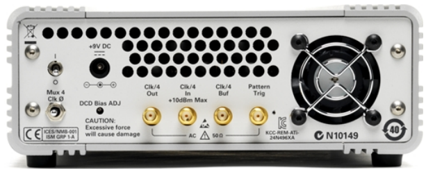
Figure 1. Front of N4975A PRBS generator 56 Gb/s. Figure 2. Back of N4975A PRBS generator 56 Gb/s.