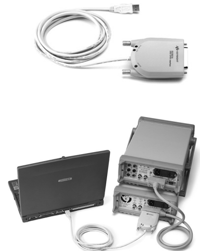
Figure 2. Keysight 82357A USB/GPIB Interface

To simplify programming of instruments over USB connections, Keysight and other test equipment vendors co-developed the industry-standard USB Test and Measurement Class (USBTMC) and USB488 I/O protocols. These protocols, along with Keysight's E2094N IO Libraries Suite, allow you to easily switch from GPIB to USB connections without making big investments in new PC software or rewriting existing programs. Aside from address conventions, your USB instruments will look and act just as they would under GPIB control.